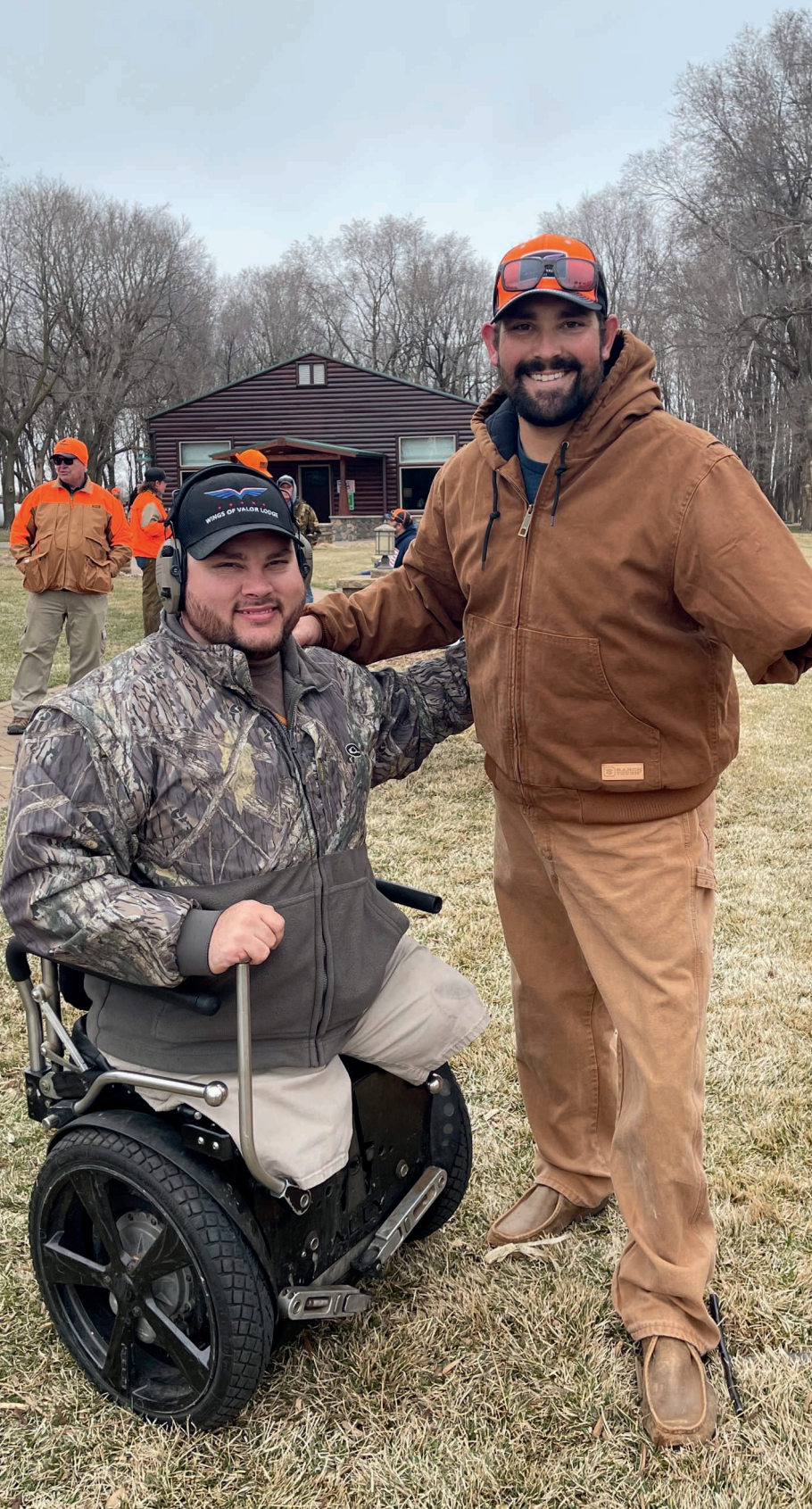
Veterans enjoying their stay at Wings of Valor.