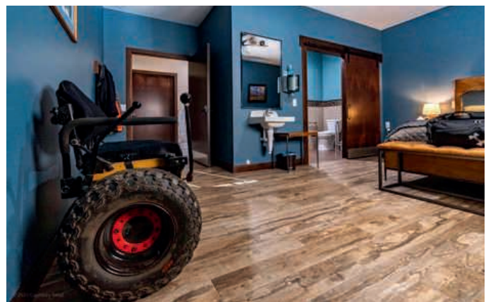
A handicap accessible bedroom at Wings of Valor lodge

To apply for a hunt or learn more about Wings of Valor Lodge, go to www.wingsofvalorlodge.org .