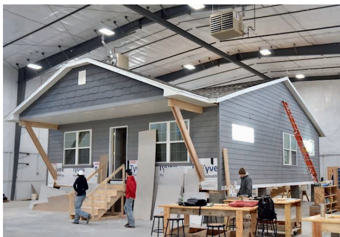
Students in the Harrisburg School District's home builders academy have built a full house.