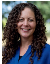
Miranda Boutelle Efficiency Services Group

Q: I'm considering a new stovetop. Can you explain the different options available?