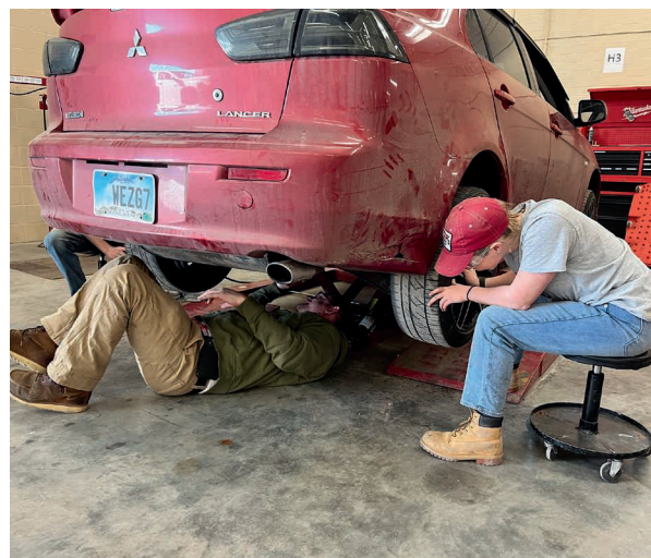
Harrisburg students working on a car in the automotive class.

"Statewide, 82% of high school students graduated on time in the 2021-22 school year, but 94% of students who were actively involved in CTE graduated on time," she said.