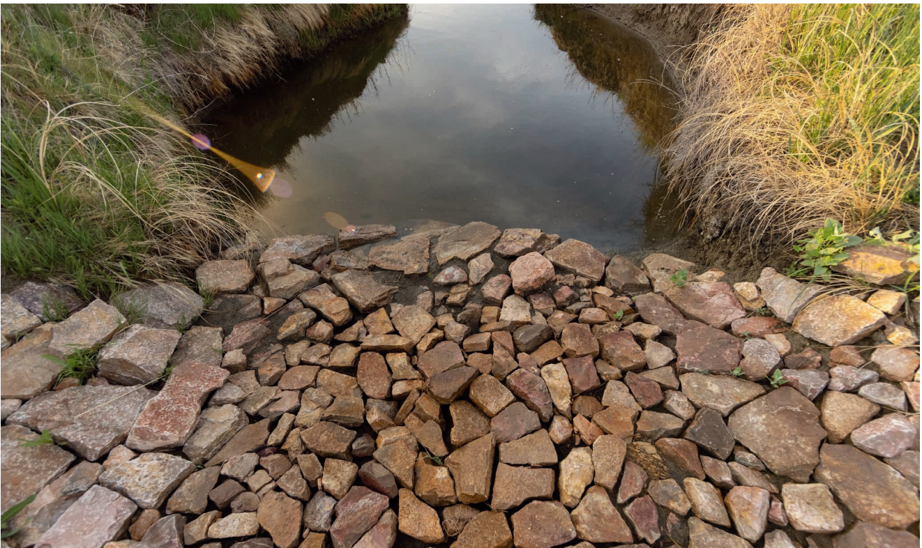
A rock structure installed to help prevent headcuts from eroding upstream reaches.