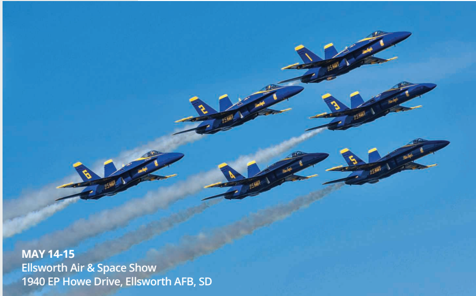
MAY 14-15 Ellsworth Air & Space Show 1940 EP Howe Drive, Ellsworth AFB, SD

To have your event listed on this page, send complete information, including date, event, place and contact to your local electric cooperative. Include your name, address and daytime telephone number. Information must be submitted at least eight weeks prior to your event. Please call ahead to confirm date, time and location of event.